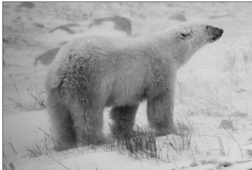
The Arctic National Wildlife Refuge was narrowly spared from oil and gas development, but the Energy Bill still looms as a serious threat to animals and the environment.

Energy Bill: Fortunately for animals and the environment, a filibuster in the Senate by Sens. Charles Schumer (D-NY), Maria Cantwell (D-WA), Richard Durbin (D-IL), Jeff Bingaman (D-NM), Judd Gregg (R-NH), John Sununu (R-NH), Susan Collins (R-ME), and others blocked the House-Senate conference version of H.R. 6, which fell two votes short of proceeding in November. While House language to open the Arctic National Wildlife Refuge for oil and gas development was dropped in conference, the bill still contains provisions to encourage drilling and other reckless development in sensitive coastal and offshore areas of critical importance to wildlife. It also would exempt oil and gas construction projects—notorious for their toxic pollution—from Clean Water Act requirements and provide billions in tax subsidies for oil, nuclear, coal, and other energy production. Efforts to move this harmful package are expected to resume in 2004.