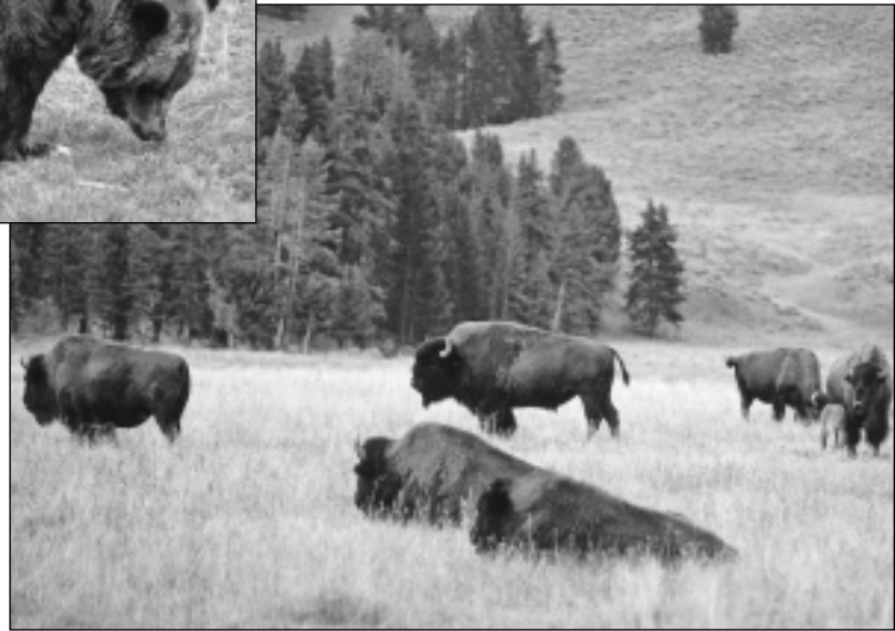
The senseless slaughter of Yellowstone bison who wander out of the park continues—with the support of federal taxpayers' dollars.

Marine Mammal Protection Act, and other laws. The new exemptions set a dangerous precedent and are truly unnecessary, since these laws already allow the DOD to waive compliance when necessary for national security.