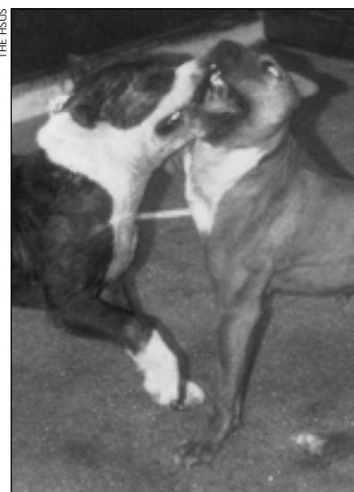
The Senate passed an amendment on animal fighting—a hopeful sign for final passage in 2004.

Animal Fighting: In addition to the House floor vote on funding to improve enforcement of the animal fighting law (see page 2), 2003 saw substantial efforts to strengthen the law itself. Sens. John Ensign (R-NV), Wayne Allard (R-CO), and Maria Cantwell (D-WA) and Reps. Roscoe Bartlett (R-MD) and Robert Andrews (D-NJ) introduced S. 736/H.R. 1532 to authorize felony penalties for violations of the federal law on dogfighting and cockfighting, to ban interstate and foreign transport of cockfighting weapons, and to make other improvements in section 26 of the AWA, which addresses animal fighting. Sen. Ensign offered this as an amendment to another Agriculture Committee measure, H.R. 1904, known as the “Healthy Forests” bill. Accepted by voice vote in the Senate in October, Sen. Ensign’s amendment was unfortunately dropped during the House-Senate conference, along with other “extraneous” provisions. But the successful Senate vote and a strong bipartisan list of cosponsors in both chambers have created momentum for enactment in 2004.