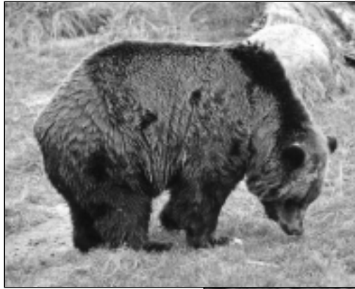
The NRA successfully pressured legislators to continue allowing the inhumane, unsporting, and dangerous practice of bear baiting on federal lands.

Military Exemptions: Congress dealt a serious blow to wildlife in the FY 04 Defense Authorization bill, H.R. 1588. At the repeated urging of the Department of Defense (DOD), Congress granted the military sweeping exemptions from bedrock federal environmental and animal protection laws. Specifically, military training and bases are now able to sidestep the conservation and animal protection provisions of the Endangered Species Act, the