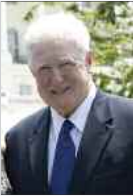
Rep. Jim Moran