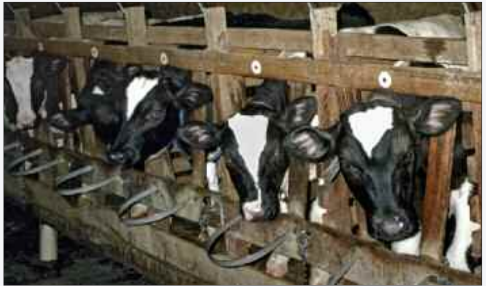
A recently introduced bill would require the U.S. government to purchase veal, egg, and pork products only from sources that don't keep animals in extreme confinement, such as these veal crates where male calves spend their days tethered in place. The current lack of animal care standards in the government's food purchasing policy is one of several factors that give factory farm products a competitive edge in the marketplace.

In addition to billions allocated annually for subsidies, the U.S. Department of Agriculture spends hundreds of millions each year on meat, egg, and dairy purchases for schools, prisons, military bases, and nutritional assistance programs for the needy. But when the industry overproduces, exceeding consumer demand, it's not shy to press the agency to buy even more, regardless of need. And as HSLF executive vice president Wayne Pacelle noted in an October 2009 blog, "Congress and USDA accommodate these unreasonable demands without hesitation, and what's more, they expect nothing of the industry in return, except perhaps political support."