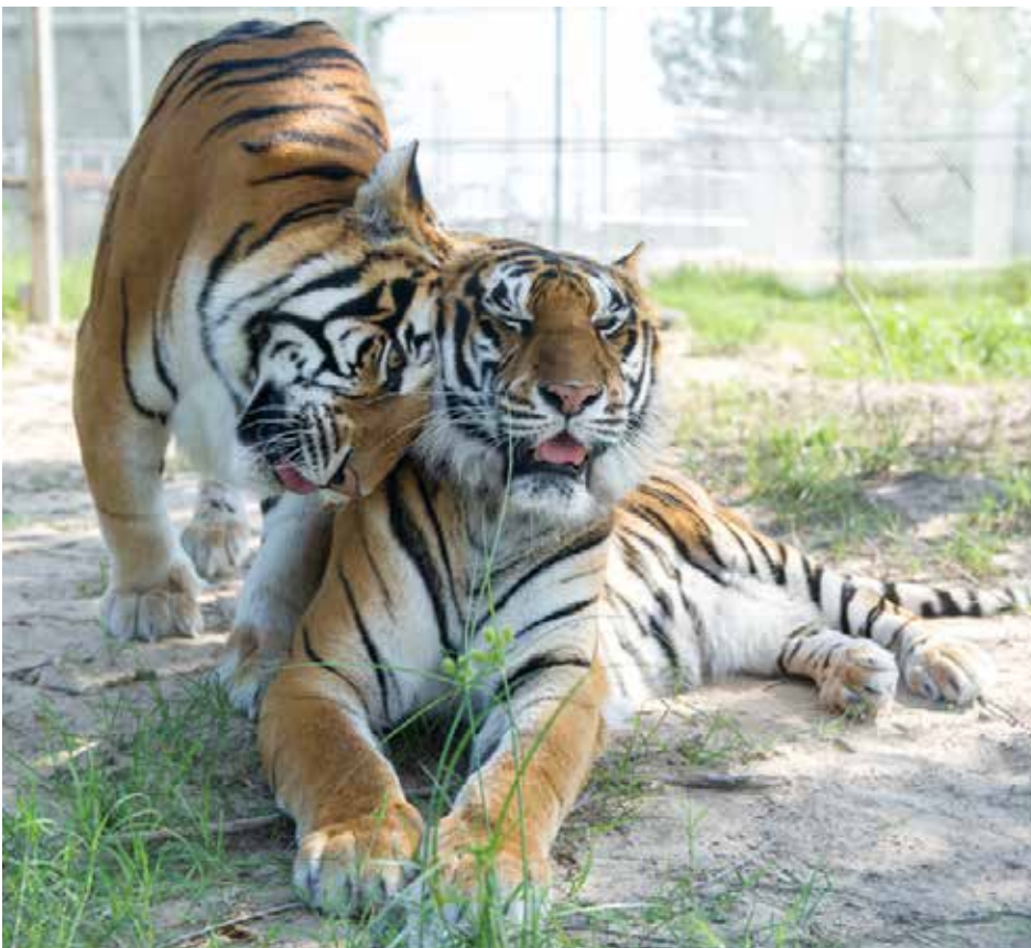
While some captive big cats, like these two tigers rescued from a roadside zoo in Mississippi in 2012, end up in reputable sanctuaries, most end their days in cramped backyard cages or squalid roadside zoos.

This isn't just a Texas problem: Big cats have been involved in more than 380 dangerous incidents in 46 states and the District of Columbia since 1990. Twenty-four people (including five children) have been killed, and hundreds of others have lost limbs or suffered