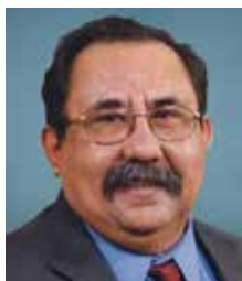
Rep. Raúl Grijalva

"I'm glad to see BLM has decided to reverse this reckless and unnecessary policy," Grijalva said. "My colleagues and I look forward to working with BLM to pursue proven, cost-effective methods to manage these animals and meet the needs of the American people in a sustainable way."